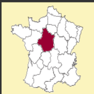
MAP OF FRANCE