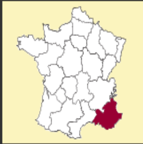
MAP OF FRANCE