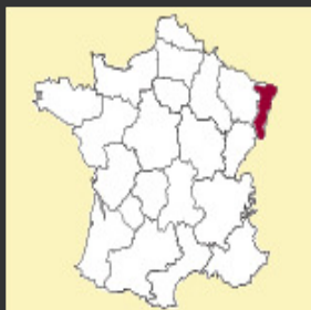
MAP OF FRANCE