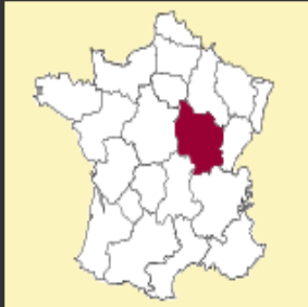
MAP OF FRANCE