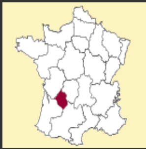
MAP OF FRANCE