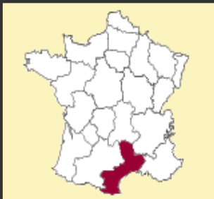
MAP OF FRANCE