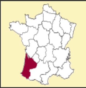
MAP OF FRANCE